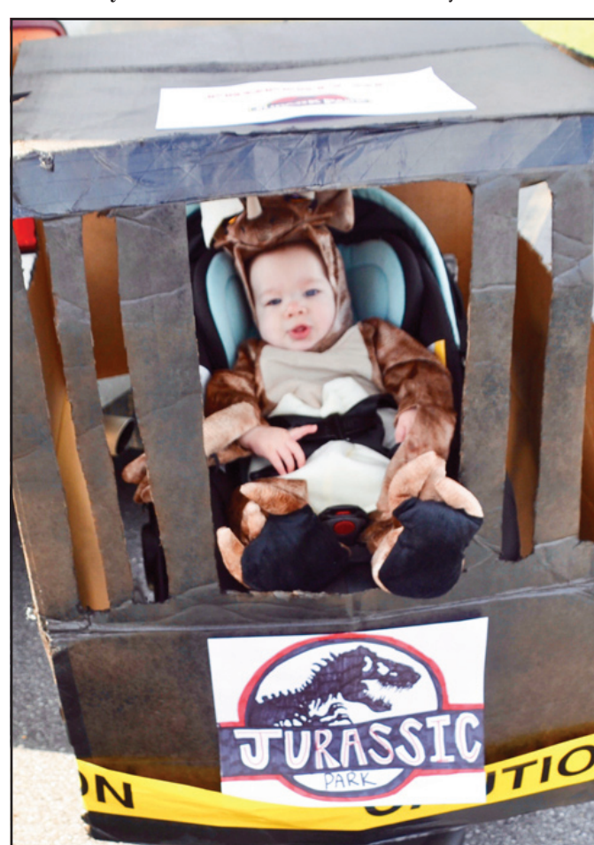
An adorable little tyrannosaurus rex paid a visit to the Drive-Thru Halloween sponsored by the Lake Chatuge Chamber of Commerce and local businesses Oct. 31.

Macedonia Baptist Church also had a drive-thru event Saturday, which led to people lining up to make their way around the church. Around 17 members of the church