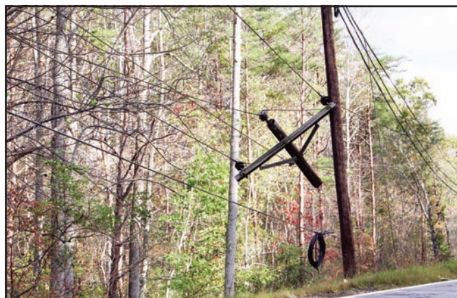
Blue Ridge Mountain EMC dealt with thousands of power outages Thursday caused by trees falling on lines and snapped poles.